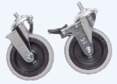
Castor Wheel Set